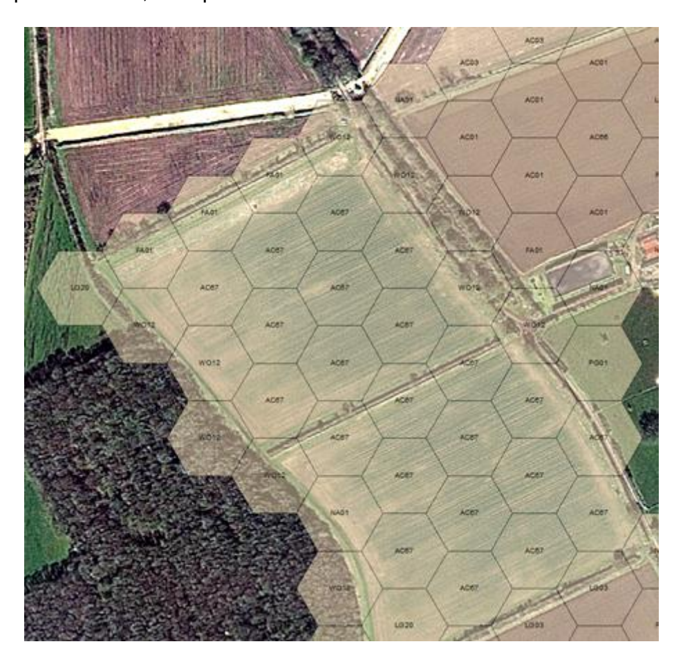
Figure 1. Example of CROME hexagonal classification cells

Each hexagon cell covers an area of 4156 sq. m., or 0.41 hectares. The hexagon cells in the CROME layer are spatially distinct units and the CROME layer does not provide any spatial adjacency information. The vertices of adjacent cells are mostly coincident; therefore, the CROME layer provides a continuous representation of the land use. The hexagon cells are not constrained by any topographic features, except the extent of the land.