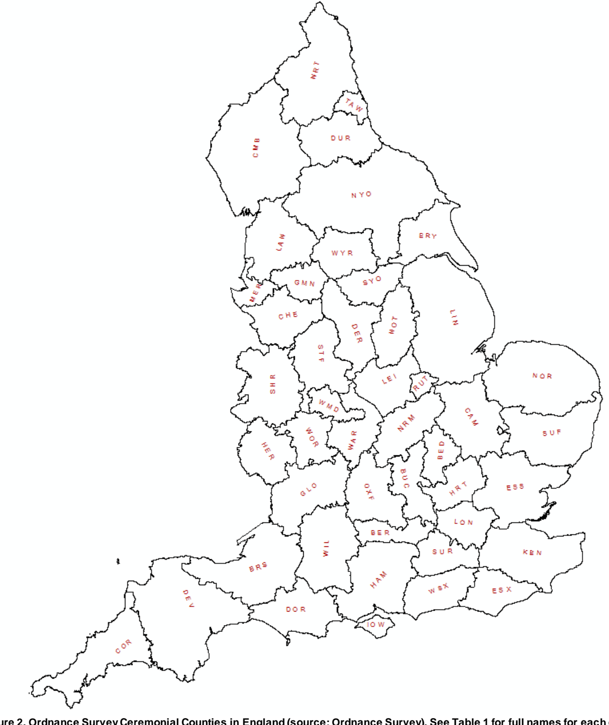
Figure 2. Ordnance Survey Ceremonial Counties in England. See Table 1 for full names for each county codes.